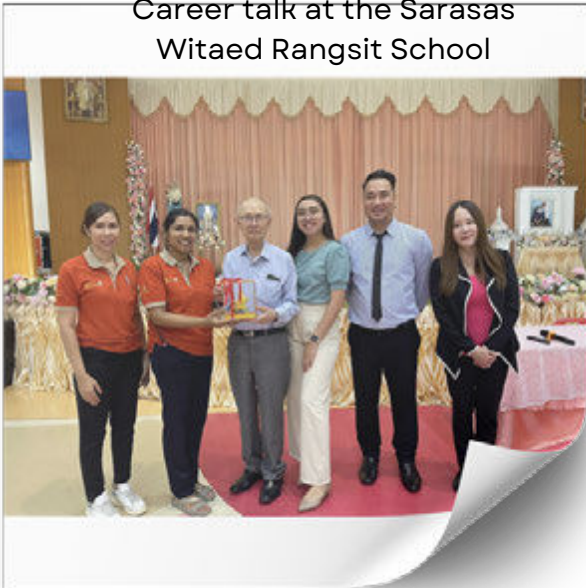
Career talk at the Sarasas Witaed Rangsit School