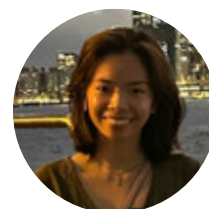
Concept and Illustration by Queen Alyssa Diwa