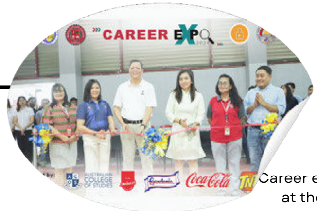
Career expo at the Mabalacat City College