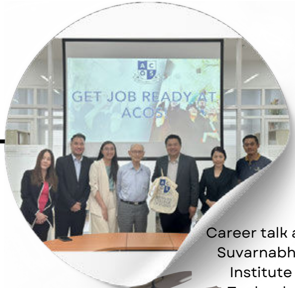
Career talk at the Suvarnabhumi Institute of Technology